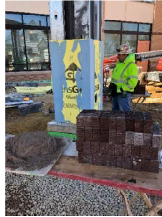
The next step is measuring out and installing the waterproof membrane (the green adhesive paper pictured above) and apply a sealant to the densglass.