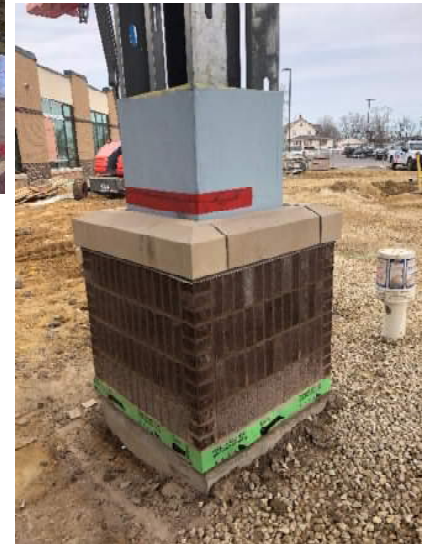
The last step is the actual installation of the masonry bricks piece by piece, then a thin metal flashing, and it is topped off with the large coping stones.