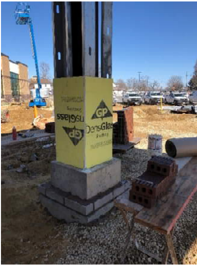
Step by step process of how the masonry piers are put together, first densglass (yellow board) is installed on the concrete piers.