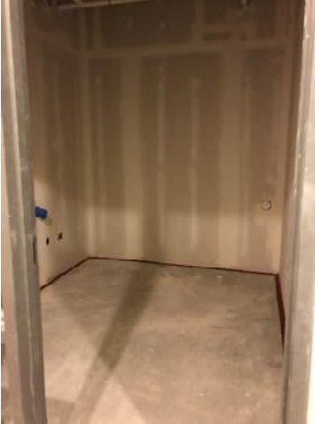
A room in the lower level Clinic / Med Surge addition ready for paint and a freshly painted corridor. The next steps for this space will be to start the finishes.