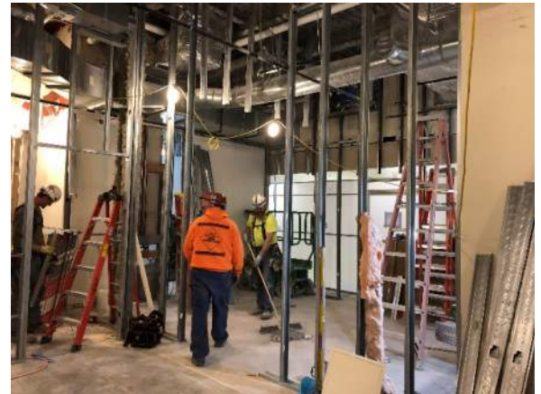
A peek into the CS department, which has stud walls installed and MEP rough ins underway.