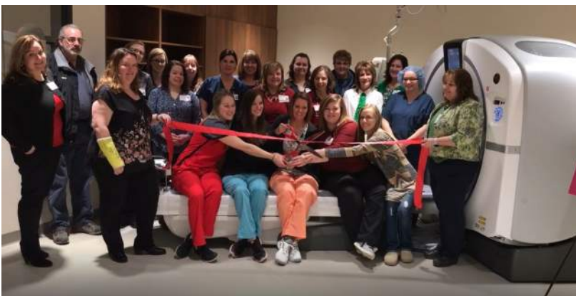
The Imaging Suite had a ribbon cutting ceremony which involved an open house for hospital staff to tour the new space, have light refreshments, and enjoy a photo booth opportunity! The construction staff participated in the fun as well.