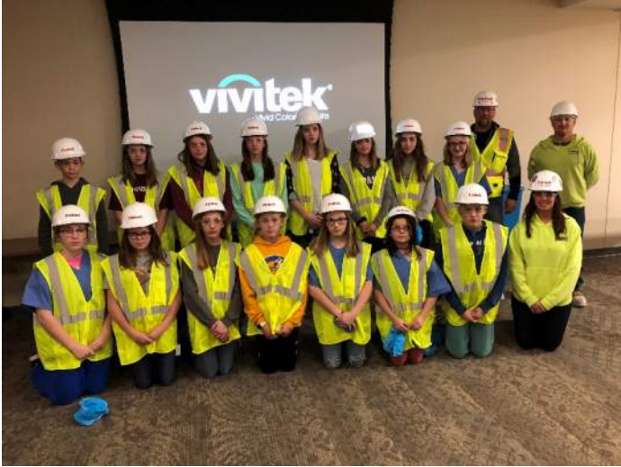
The Findorff team gave a career presentation followed by a construction site tour to the Club Scrub kids within the past weeks.