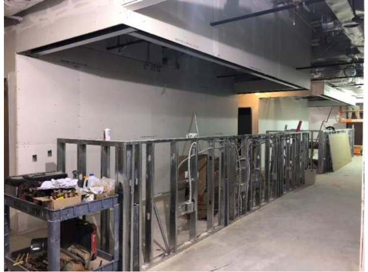
A view of a nurse station in the lower level Clinic / Med Surge addition. The drywall taping followed by painting will move into the north and south end of this area next which includes this station.