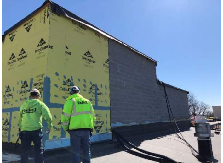
The Findorff field team collaborates on the roof (this is the elevator shaft pictured) for the insulation installation.